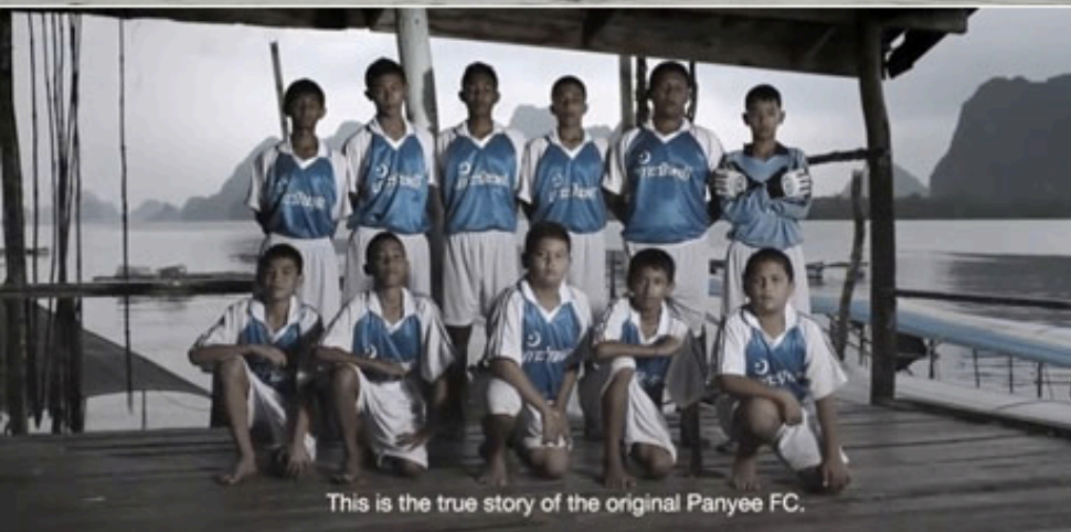
This is the true story of the original Panyee FC.