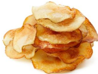
2.2 Potato Chips