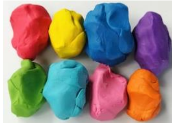
2.5 Play Doh/ Clay