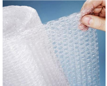
2.6 Bubble Wrap